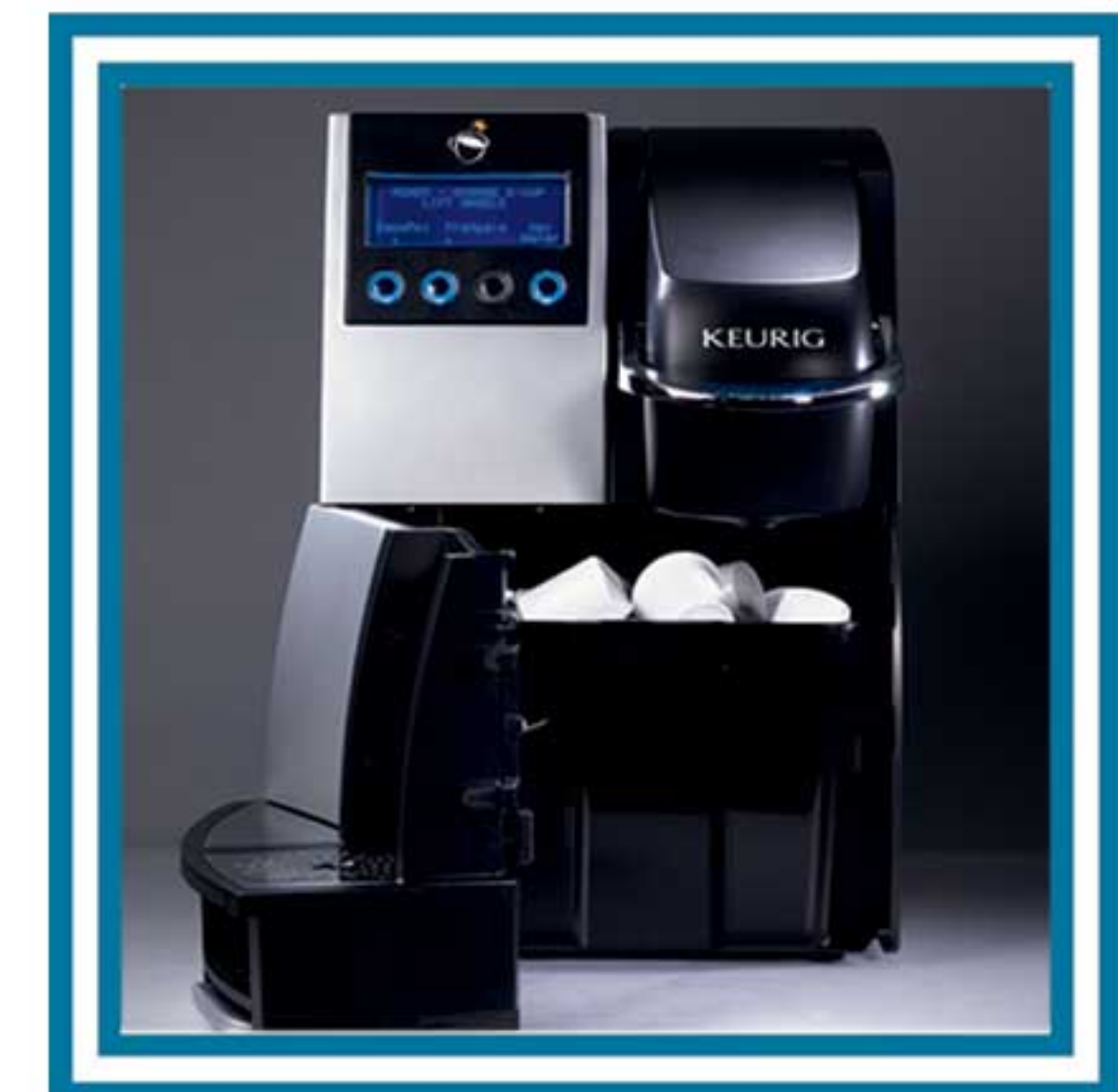
Easy access to used K-Cups