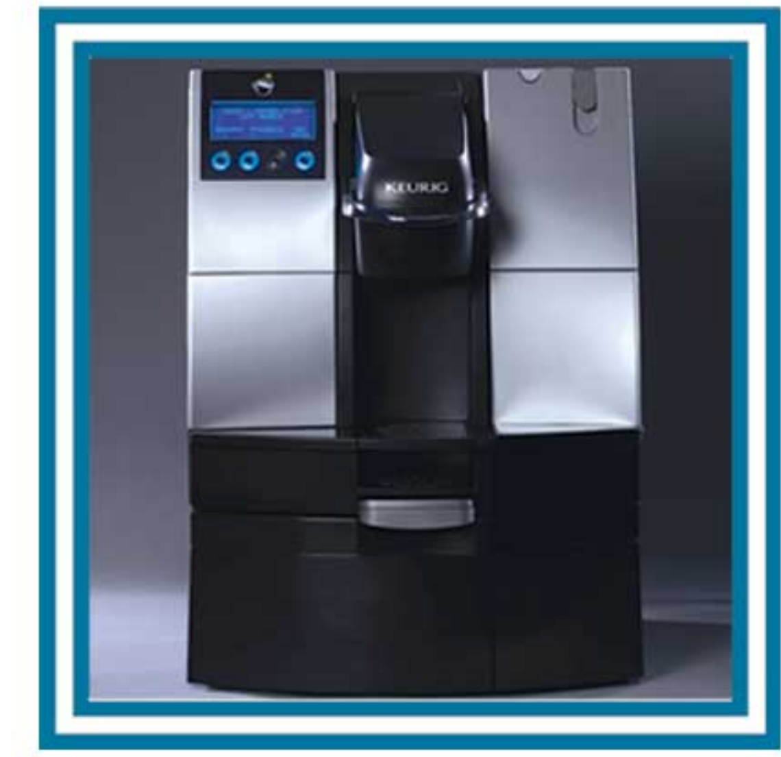
Platform and Coin Changer