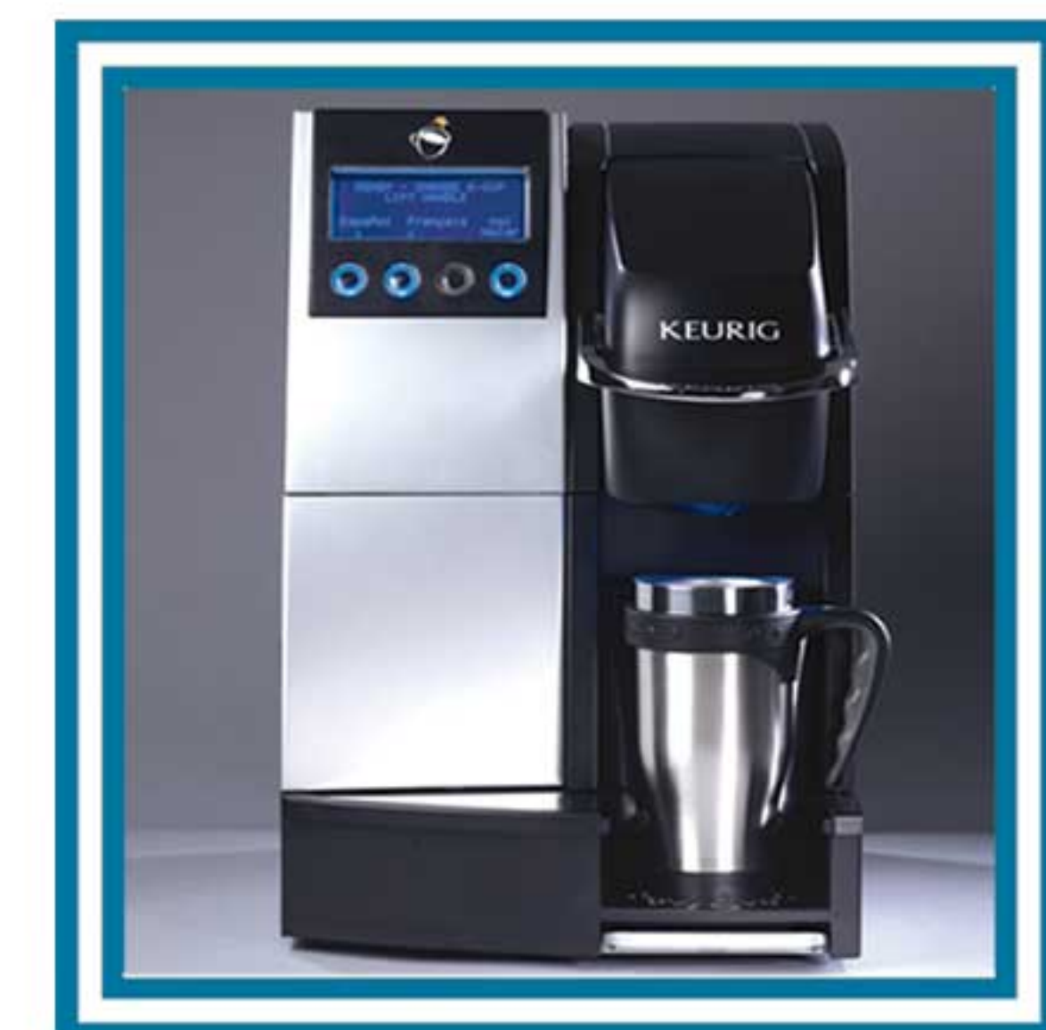
Drip tray and travel mug “flip” design