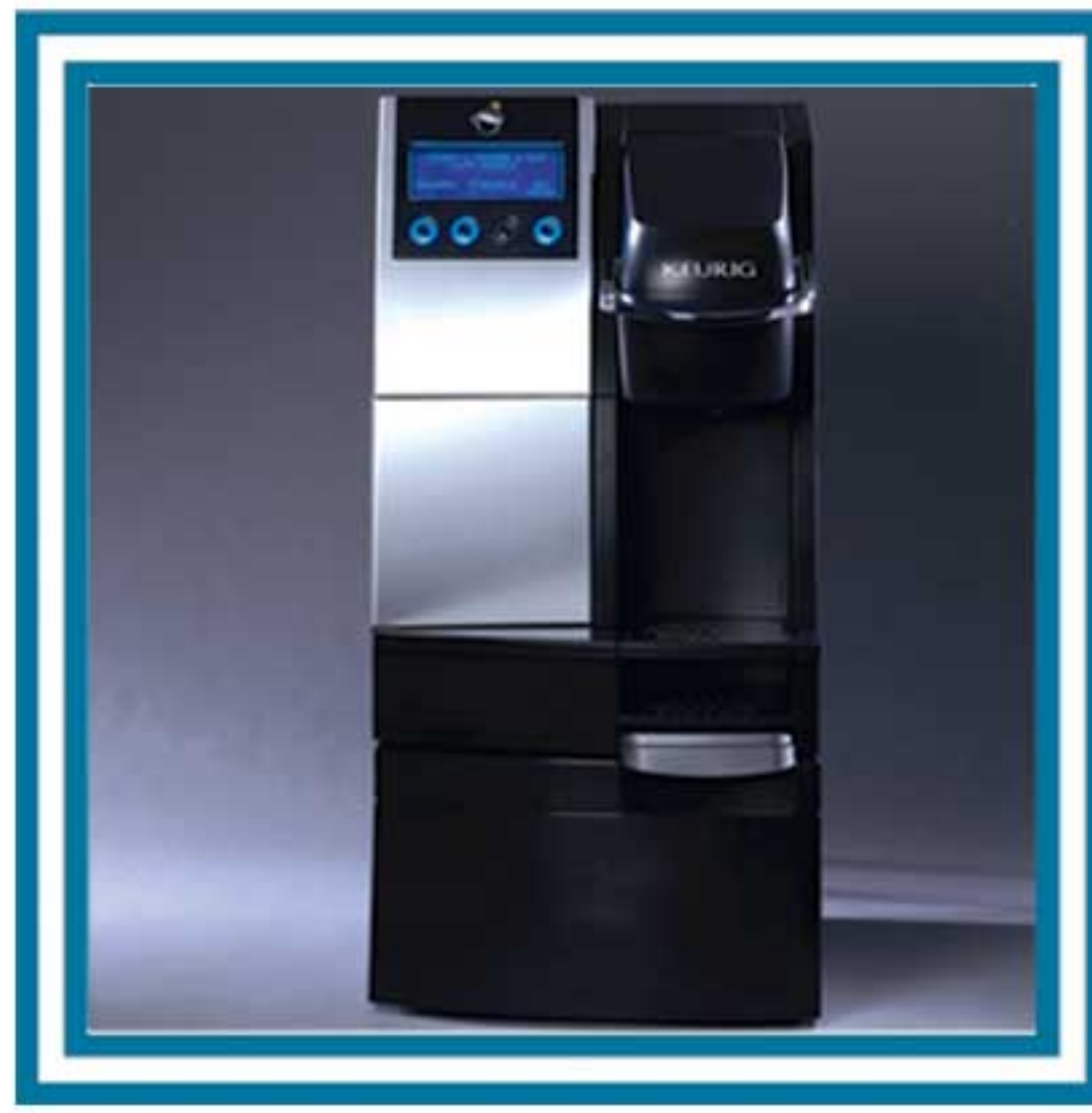
K-Cup Storage Platform