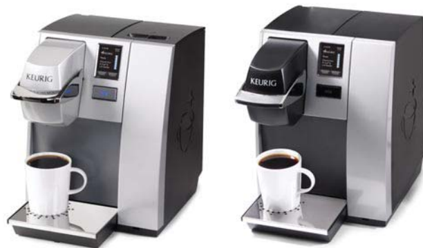
Keurig B155 (left) and B150 midsize commercial coffee brewers

Both new brewers incorporate 90-fl.oz. reservoirs (Keurig's largest), and their hot-water tanks are easily drained for convenient transport and storage. Both are fitted with controllers offering an energy-saving program, which